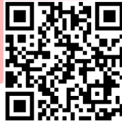
Link will also be on Dojo and the Website!